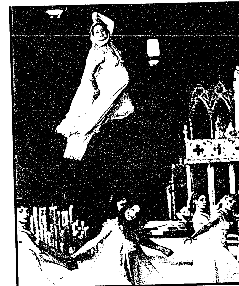
Beverly D'Angelo floats through a hallucinogenic dream sequence in Half , which shows on campus this weekend.

Batman The famous superhero and his eloquent sidekick take on the Joker, the Penguin, the Riddler and the Catwoman all at once! Lots of memorable fight scenes and "bat-gadgets." About as campy as the popular TV series, if not more so. Classic romantic scenes between Batman and Catwoman. Adam West stars as the Batman, Burt Ward as his faithful sidekick Robin. Don't miss it! Tonight and tomorrow night, 7, 9 and 11, Sunday night, 7 and 9, 102 Forum. Presented by the Penn State Science Fiction Society.