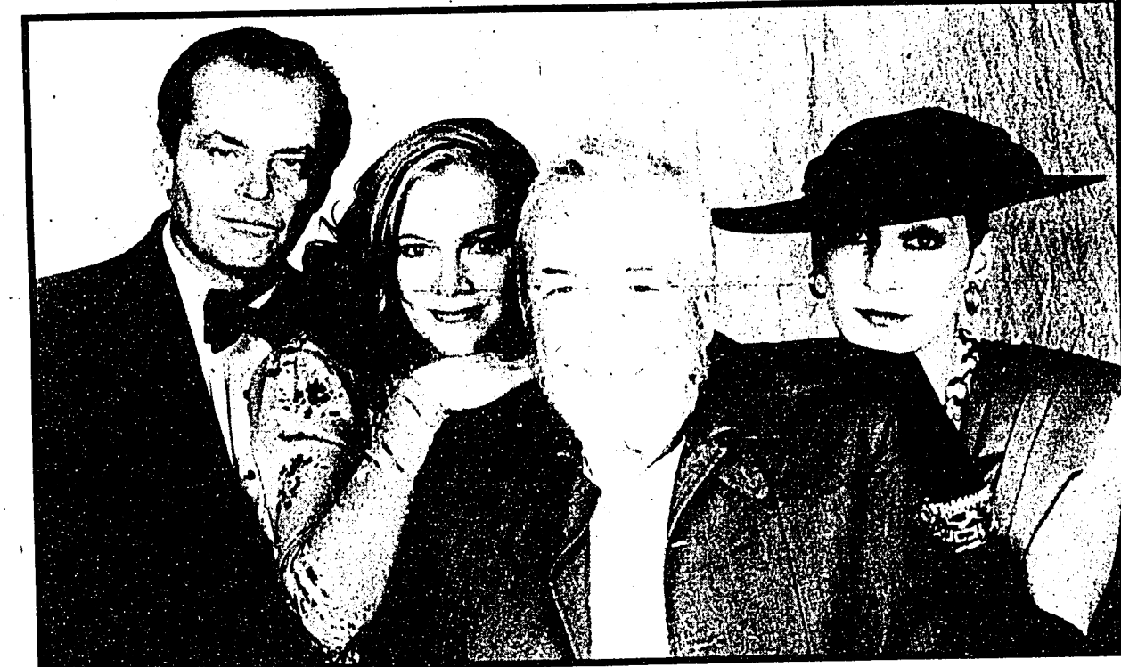
From left to right, Jack Nicholson, Kathleen Turner and Anjelica Huston, the stars of Prizzi's Honor , surround their director, John Huston (foreground). The movie plays downtown this weekend.

Teen Wolf Yet another comedy starring Michael J. Fox, though this one doesn't have the appeal of his hit, Back