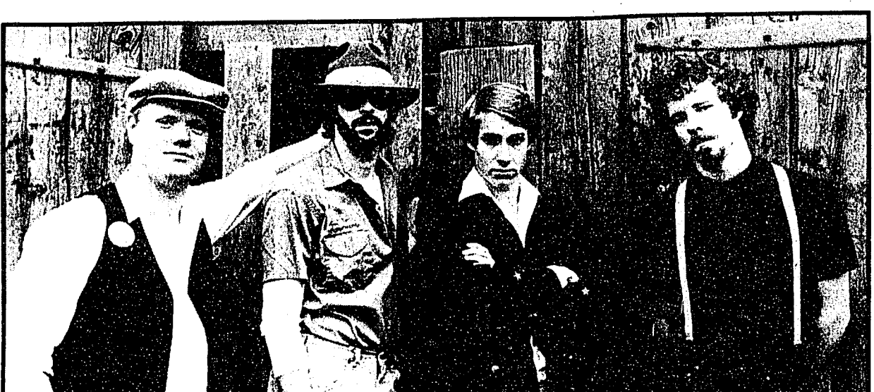
Cheater Jones will give honest performances at the Brewery and the Rathskeller this weekend. The Central New Jerseybased band specializes in funk-rock music. This is the group's first State College performance since acquiring a