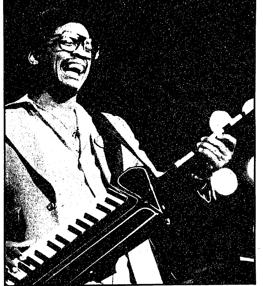
Get ready for out-of-this-world jazz entertainment tomorrow night at 8, when Herbie Hancock and the Rockit Band Ignite Rec Hall.