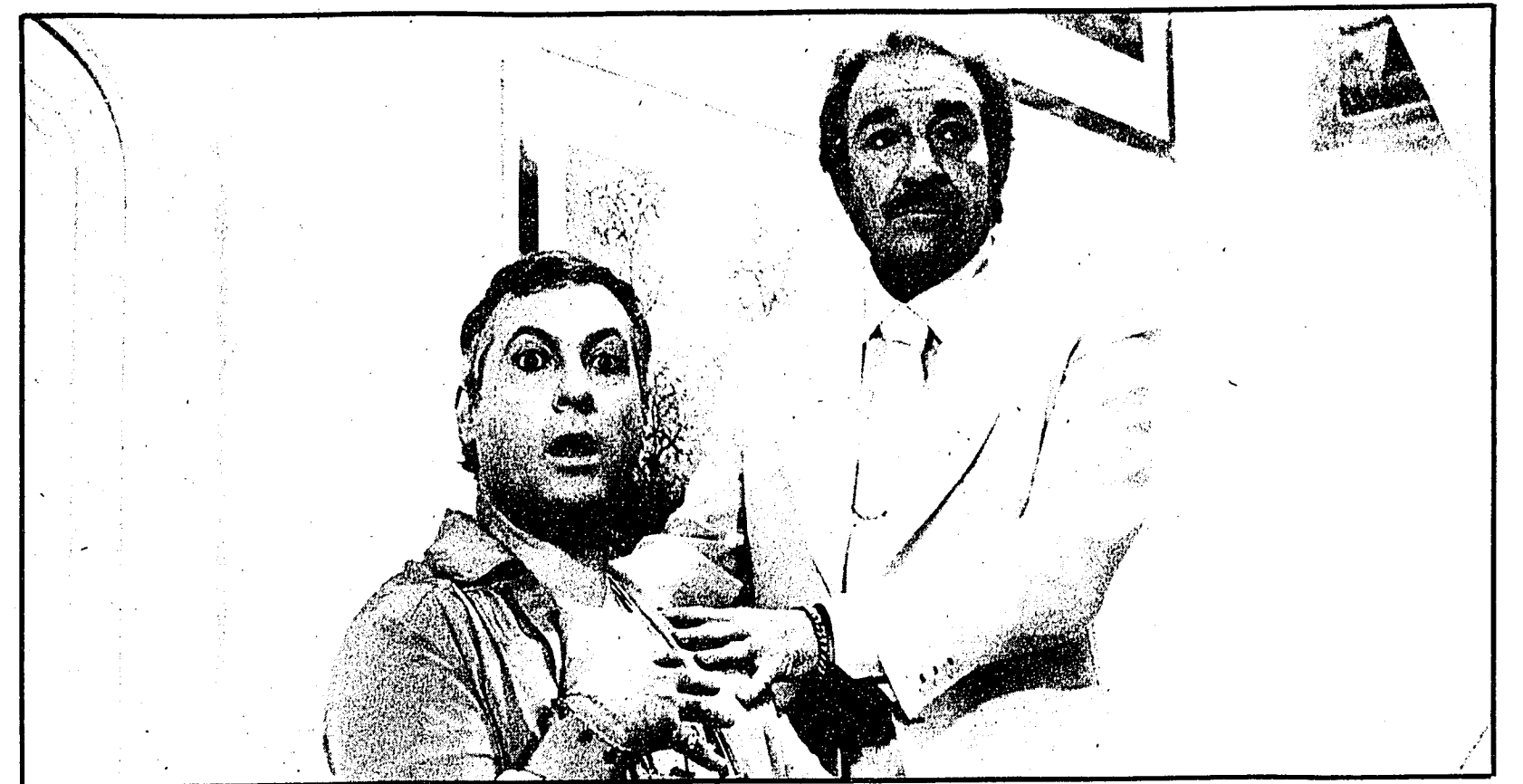
(Left) ZaZa Albin, played by Michel Serrault, and Renato Baldi, played by Ugo Tognazzi, are roommates in "La Cage Aux Folles."

"The Third Blues Blaster Film Festival" Yes, folks, it's two non-stop hours of rare and classic jazz films. Showing Monday night at 9:30 at the Scorpion.