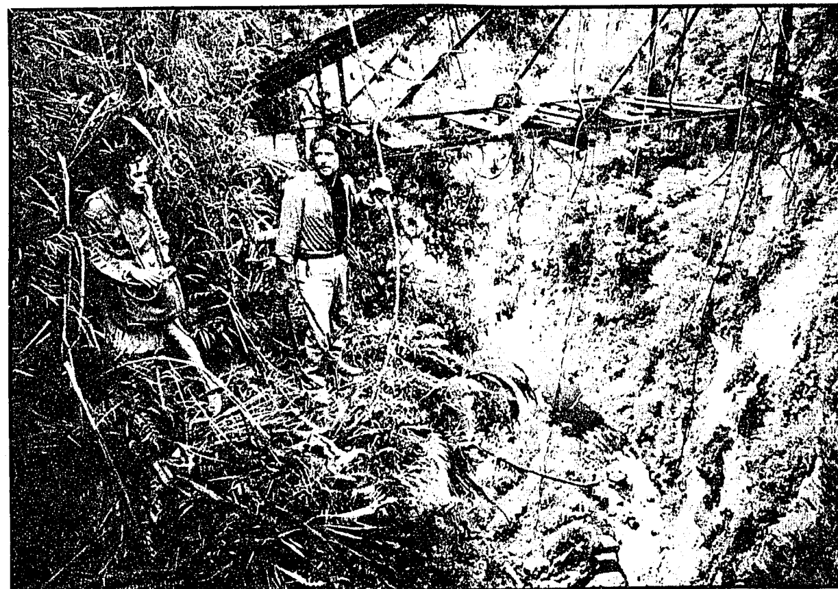
In "Romancing the Stone," a novelist, who tries to add spice to her monotonous existence by writing trashy romances, gets caught up in a treasure hunt that leads her into the jungles of South America.