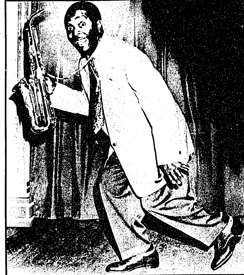
Louis Jordan is one of the great jazz artists featured in "The Third Blues Blaster Film Festival" at the Scorpion Monday night.