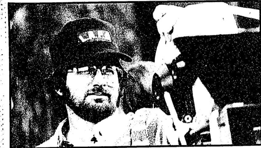
Filmmaker Steven Spielberg (above) on the set of "Twilight Zone - The Movie." The movie is divided into four segments, directed by (one each) Spielberg, John Landis, Joe Dante, and George Miller. Scatman Crothers (below) stars in Spielberg's segment.

"The Last Waltz" Martin Scorsese's excellent concert film with Bob Dylan, Joni Mitchell, Van Morrison, and others. Tonight, tomorrow and Sunday at 8:00 and 10:00 in 102 Forum.