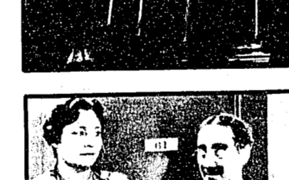
The sensational sounds of the Daddy Licks Band (above) can be found at the Scorpion this weekend, while Groucho Marx (left) and brothers can be found on campus in the hilarious "A Night At The Opera."

Sports Track The United States Junior National Track and Field Championship will be held