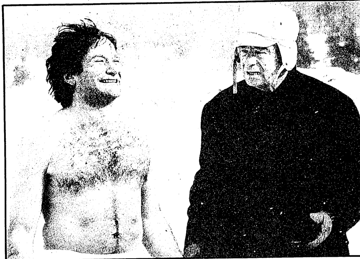
Robin Williams and Walter Matthau (above) star in "The Survivors" opening downtown this weekend. Christopher Reeve (right) is Clark Kent, alias "The Man of Steel" in "Superman III" also playing in town.

"Sleeper" The Student Union Board will present this movie