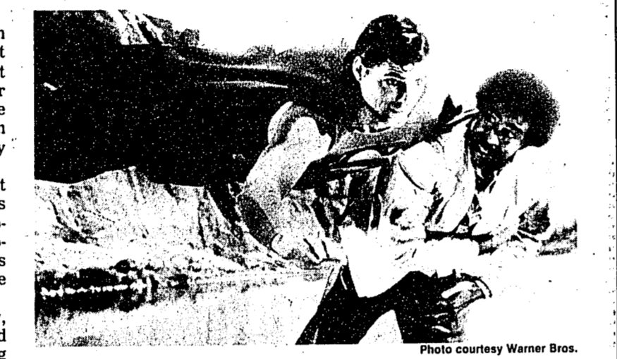
Villian Richard Pryor gets a lift from Christopher Reeve in Superman III.

Meanwhile, company president Ross Webster (Robert Vaughn) is looking for someone who can program computers to cause meteorological havoc on South America's coffee bean crop and control the world's oil tankers. If you haven't guessed it by now, Superman meets Gorman and Webster in a showdown involving computer treachery, world domination and, of course, Kryptonite.