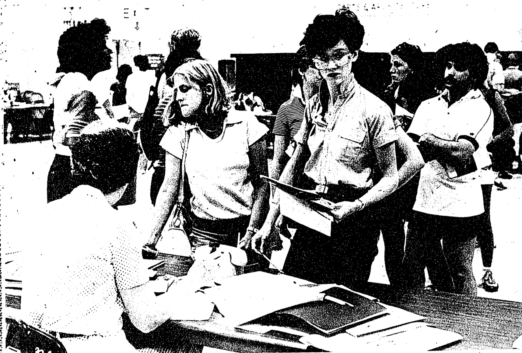
Being at the mercy of the computer makes students wonder if they'll get the classes they have chosen. If the computer fails, there's always dropladd . . .