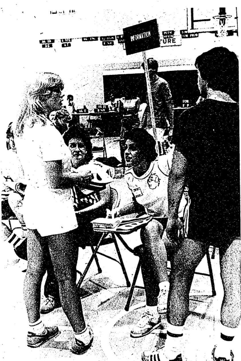
Even when all seems lost, the information tables at registration can help students solve most problems. Here, a student gets help figuring out what table to go to next.

For information and help in deciding about participating, call (863-0395) or stop by — Monday-Friday, 8:00 A.M. - 5:00 P.M. at 217 Ritenour Health Center.