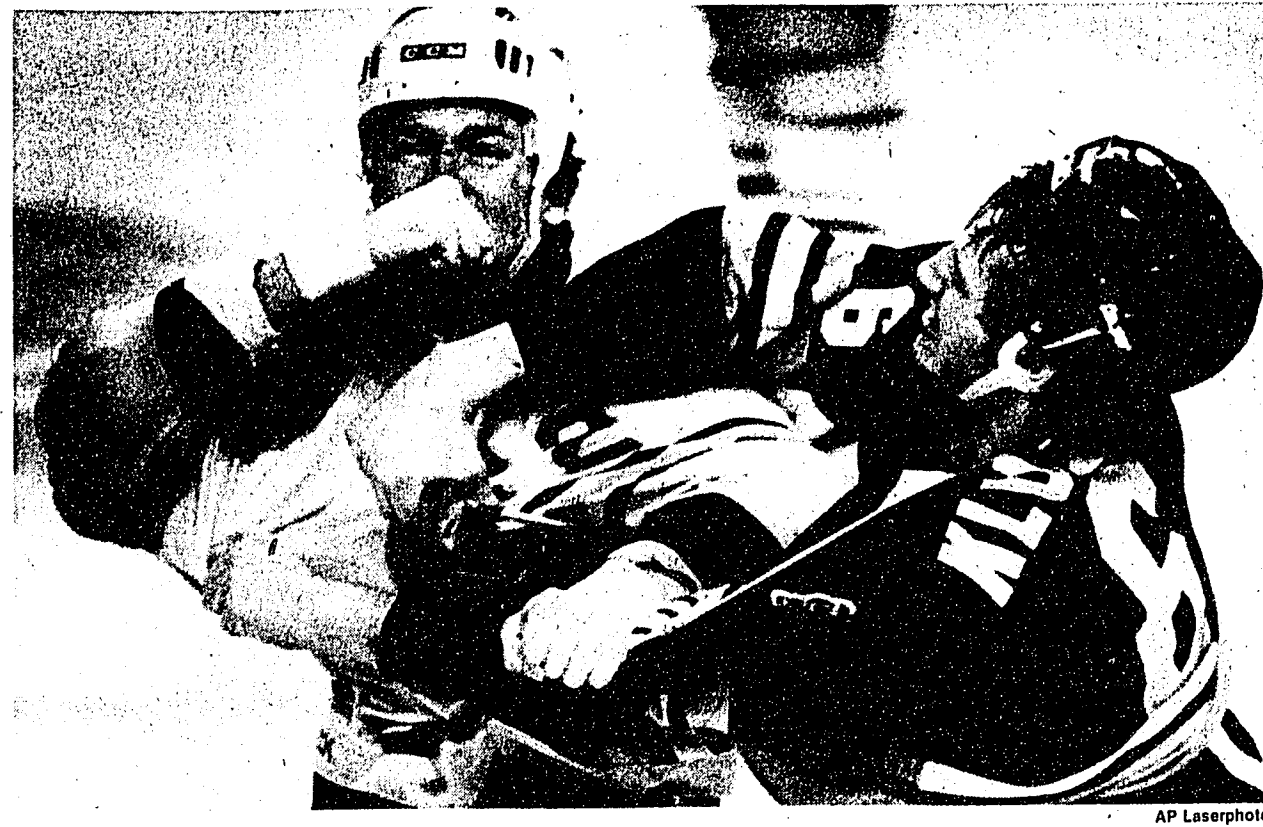
Ruff him up Buffalo Sabre Lindy Ruff (left) wrestles with Boston Bruin Gord Kluzak (6) in a brawl during the Adams Division Championship series game Monday night in Buffalo. Both players were tossed from the game, as Boston won 6-2.