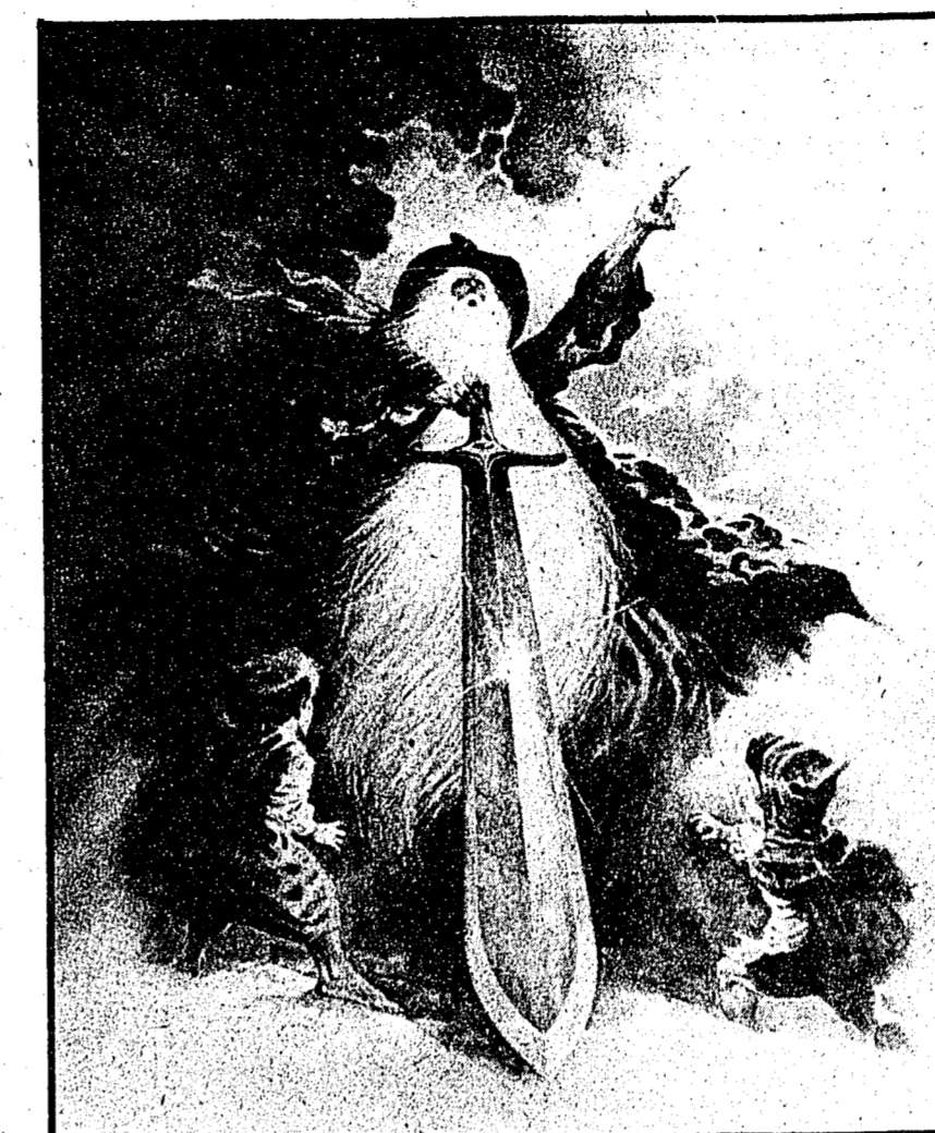
Gandalf, Frodo and Sam can be seen in J.R.R. Tolkien's "The Lord of the Rings," one of the many movies showing on campus this weekend.

Douglas Albert Gallery This downtown gallery offers the community lots of art, including work by established local artists. A free public