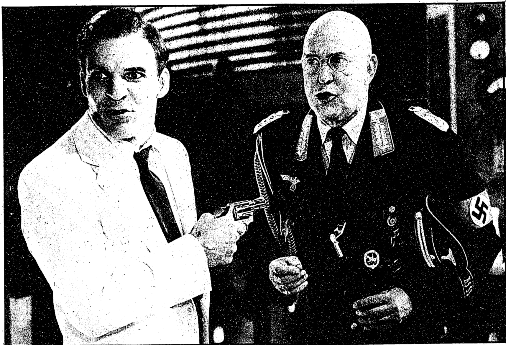
Detective Rigby Reardon (Steve Martin) and Field Marshal Von Kluck (Carl Reiner) argue over who gets to reveal the plot of the movie "Dead Men Don't Wear Plaid," showing on campus this weekend. Also starring Rachel Ward, scene recently in the television mini-series "The Thorn Birds."

"Sophie's Choice" Meryl Streep deservedly won an