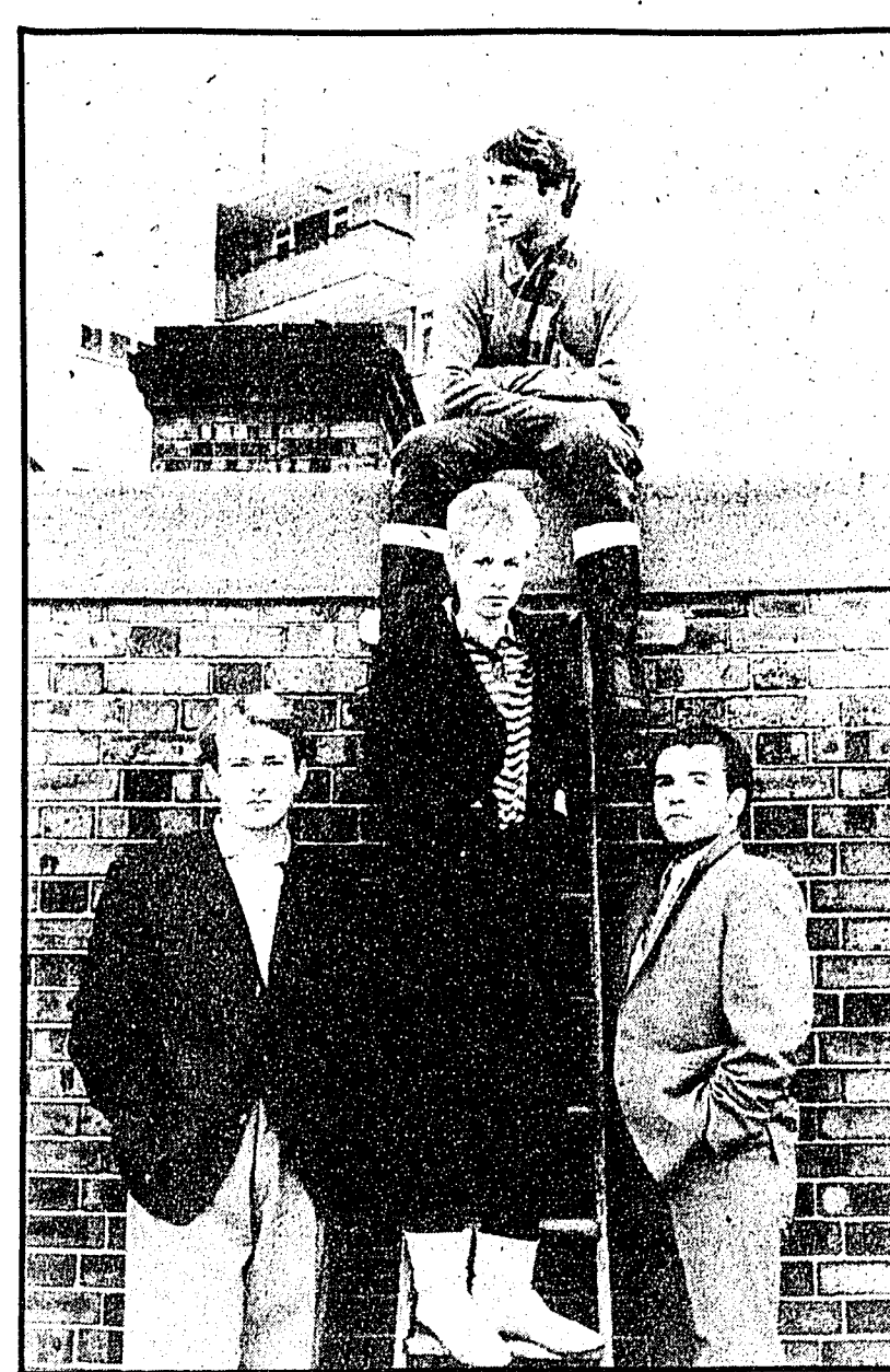
Forty-five minutes of Gang of Four in concert will be broadcast at 8 tomorrow night as part of WDFM's weekend programming. The noncommercial, student-operated station can be found at 91 on your FM dial.

State College Area Music Guild presents a concert at 2:30 Sunday afternoon at the First Presbyterian Church, Spring Street, Bellefonte.