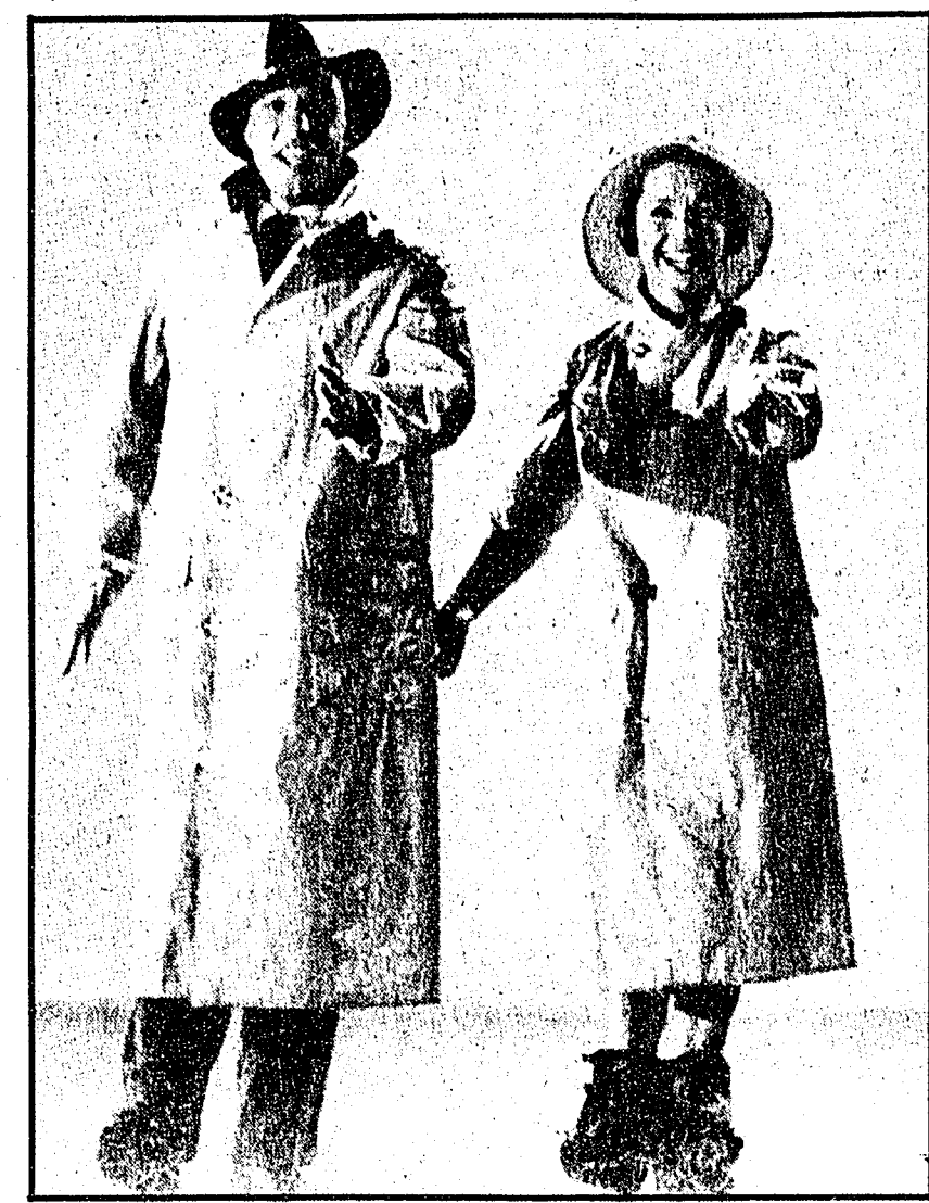
Gene Kelly and Debbie Reynolds are at their musical best when "Singin' in the Rain" plays on campus this weekend.

Westerly Parkway HiWay Pizza Tonight the Tarnished