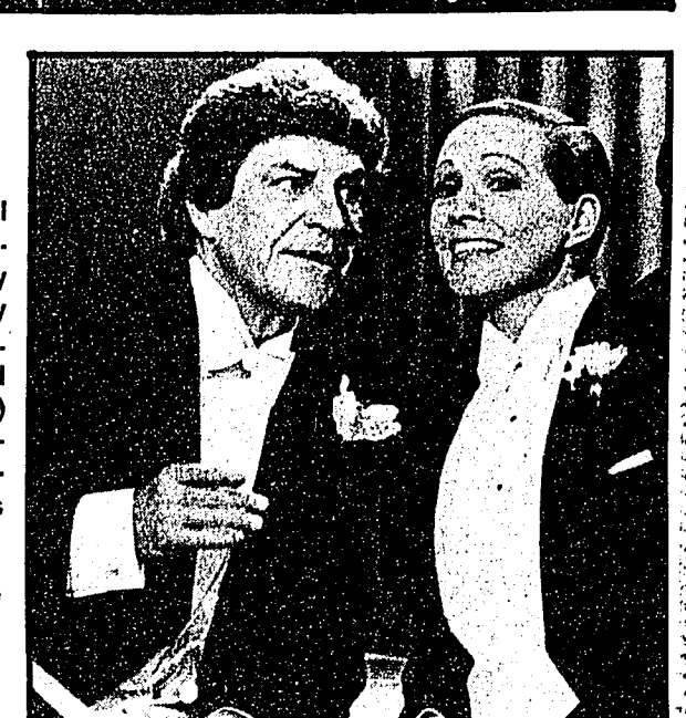
Cartoon (above) will put you in the holiday mood when they perform Wednesday night at the Phyrst. Robert Preston and Julie Andrews (right) star in the zany "Victor Victoria," playing on campus this weekend.