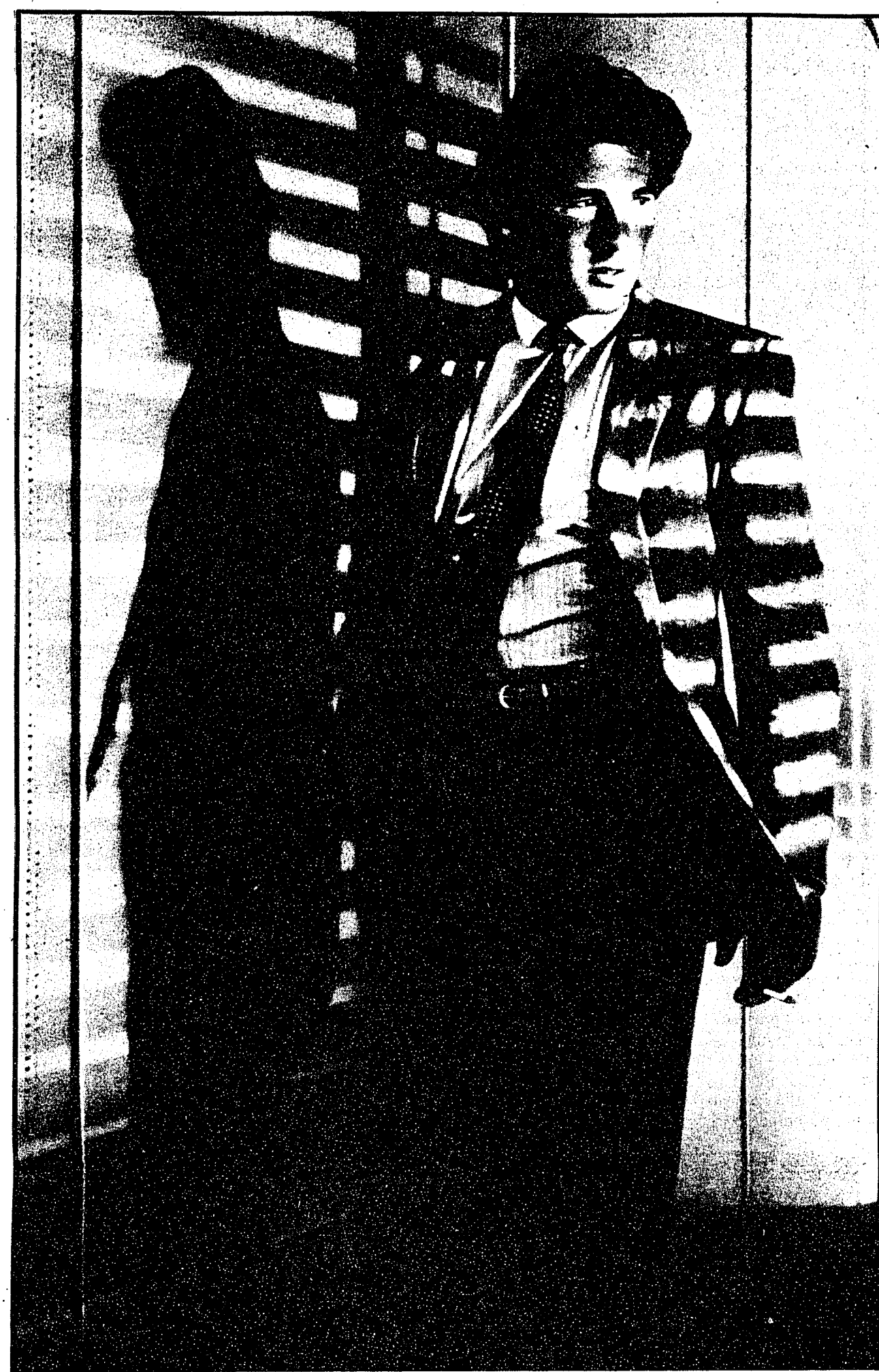
Take some time out from your hectic weekend of packing, card-addressing and gift-buying to soak up some of the fine entertainment that comes to the area. For those of you film enthusiasts, Richard Gere stars as the impeccably groomed stud-for-hire in "American Gigolo," playing on campus.