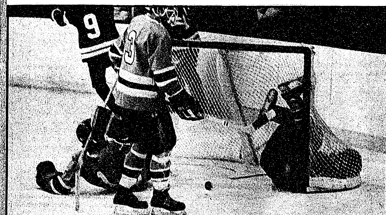
The ice hockey club, seen in action against Buffalo, is set for a fiery weekend on home ice. Rink action begins at 9:15 tonight when Penn State plays host to the Junior Flyers at the Indoor Sports Complex. Cortland State invades the Complex tomorrow for a 7 p.m. contest.