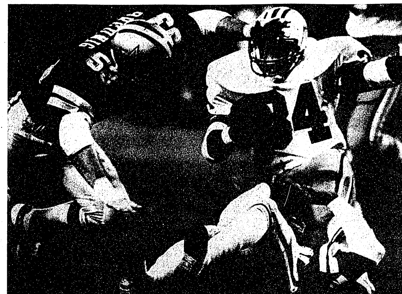
The Dallas Cowboys effectively shut down Earl Campbell (34) of the Houston Oilers last night in the Cowboys 37-7 romp over the Oilers in Houston.

HOUSTON (AP) — Dallas' Danny White fired three touchdown passes, two to Butch Johnson and Michael Downs returned a fumble 86 yards for a touchdown as the Cowboys mauled the Houston Oilers 37-7 last night.