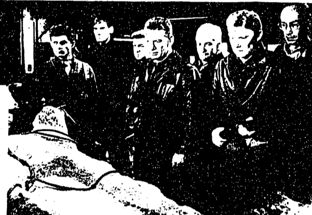
Director: Christian Nyby Cast: James Arness, Margaret Sheridan, Kenneth Tobey

A U.S. Air Force research team, isolated in the Arctic region, is attacked by a ferocious creature with the chemistry of a plant that lives on human blood and multiplies a hundred-fold in a matter of hours. Based on the novel Who Goes There? by John W. Campbell, Jr., this classic science fiction film stars James Arness.