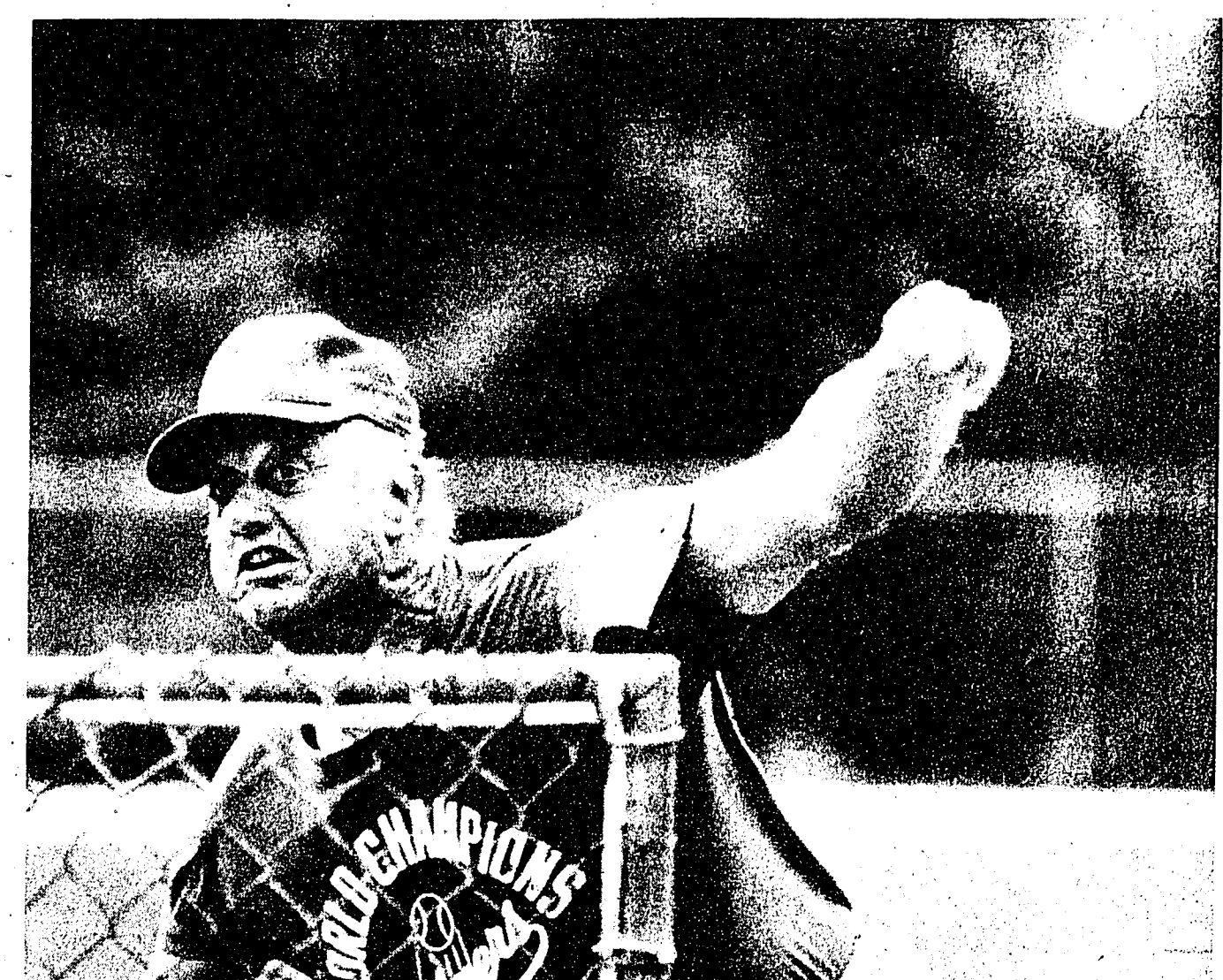
Lefty Lasorda Los Angeles Dodgers' manager, Tommy Lasorda, delivers a pitch to Ron Cey during batting practice at the Los Angeles camp at Vero Beach, Fla. Lasorda was a pitcher during his playing career.