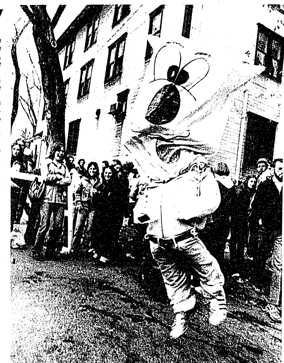
A serious group of runners begin the Phi Psi 500, left, while an "Anything Goes" participant, above, does... well... anything.