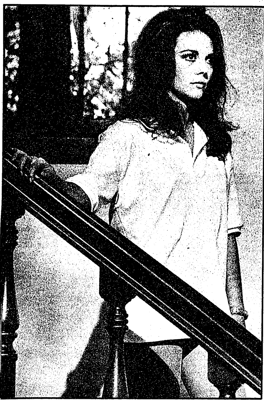
The HUB Movie Crew continues its tribute to Natalie Wood with "Bob and Carol and Ted and Alice" playing on campus this weekend.