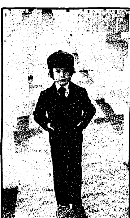
Little Damien, little menace, in "The Omen," a chiller, thriller on campus.