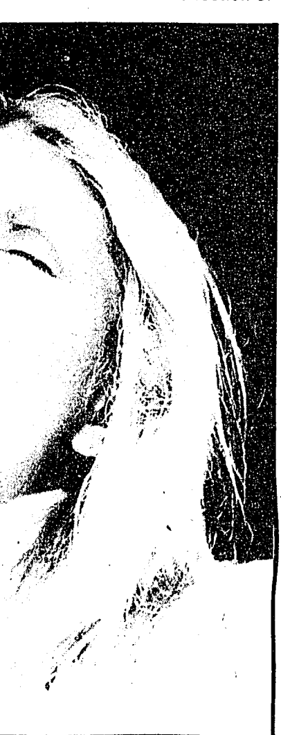
Annie Haslam of Renaissance (above) brings the sounds of "art rock" to the University this weekend with a concert at 8:30 p.m. Sunday in Eisenhower Auditorium.