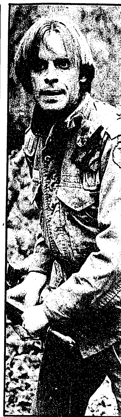
Keith Carradine stars in "Southern Comfort," a harsh look at the National Guard.