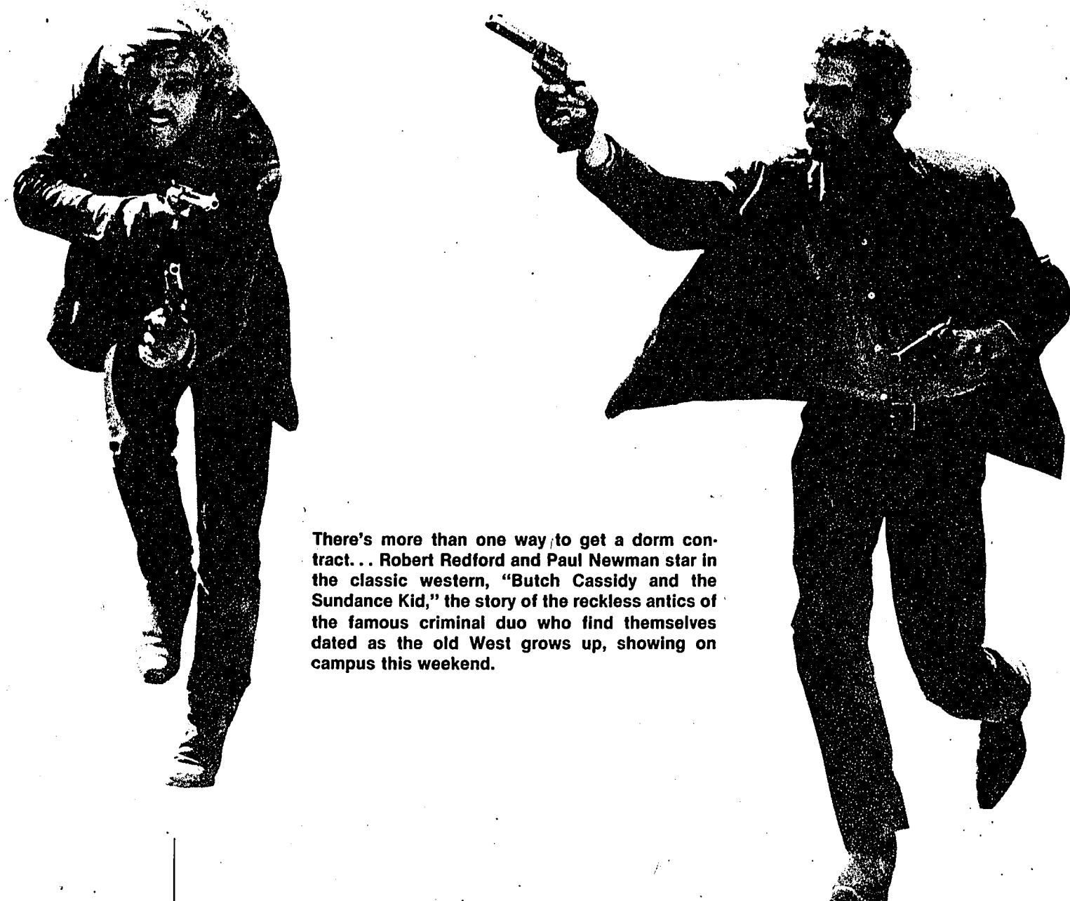
There's more than one way to get a dorm contract... Robert Redford and Paul Newman star in the classic western, "Butch Cassidy and the Sundance Kid," the story of the reckless antics of the famous criminal duo who find themselves dated as the old West grows up, showing on campus this weekend.