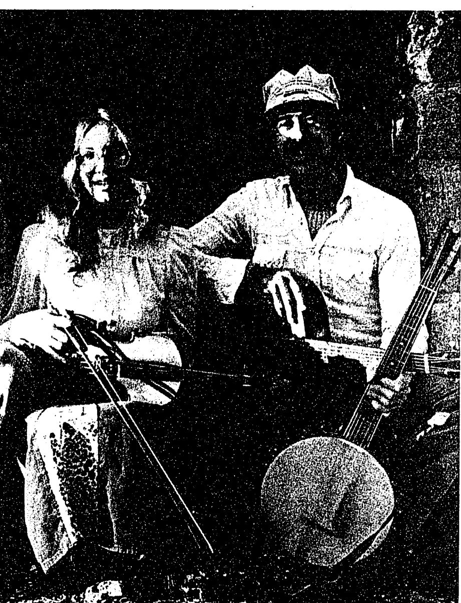
The Juggernaut String Band (above) offers an evening of bluegrass music and square dancing at 8 tonight in the HUB Ballroom. Sponsored by the Penn State Folklore Society, Warren Beatty and Diane Keaton (right) star in 'Reds,' opening downtown.