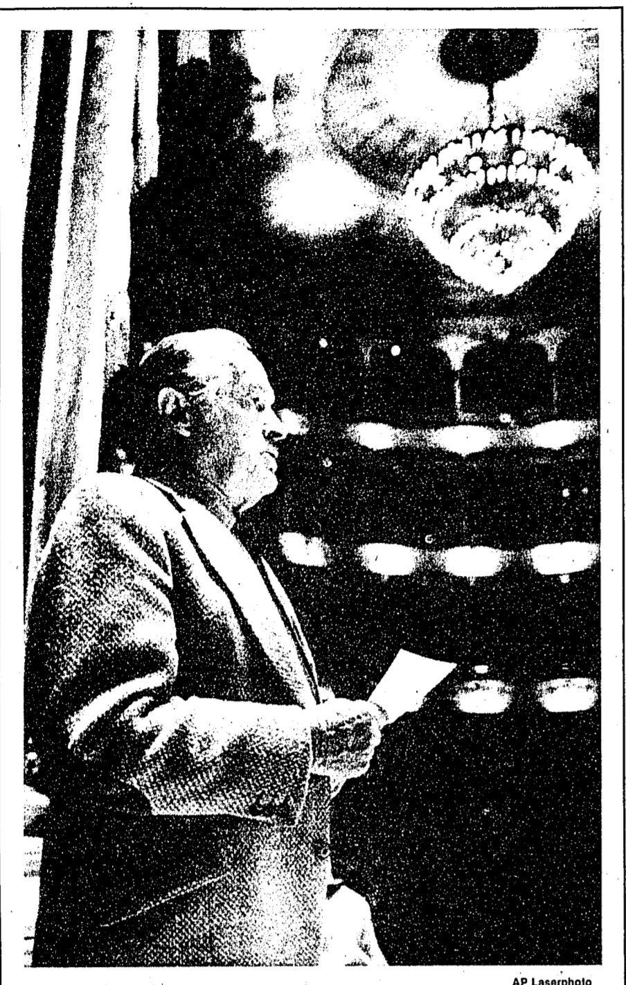
Bob Hope, shown standing off stage during a rehearsal, was the key performer Tuesday night at the Academy of Music in Philadelphia at a benefit to raise enough money to reinstate a football program at nearby Villanova University. This season was the first in 88 years the university did not field a team.