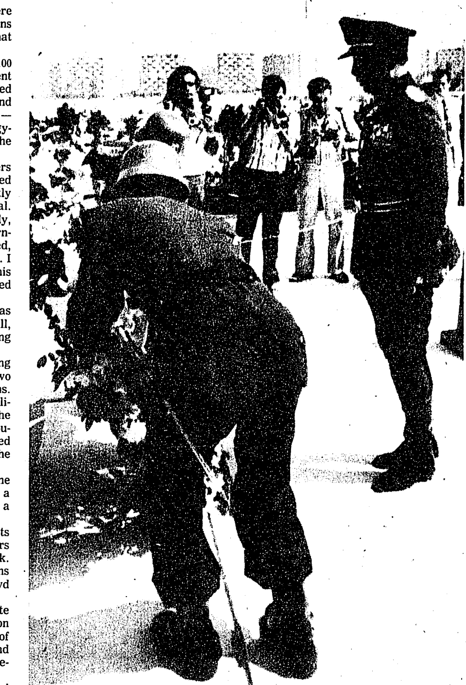
Egyptian President Anwar Sadat looks on as a wreath is placed at the tomb of the unknown soldier before the 6th of October military parade yesterday. Sadat was later shot and killed by soldiers riding in the parade.

fled explosions, but it was difficult to suburb, called "Victory City."