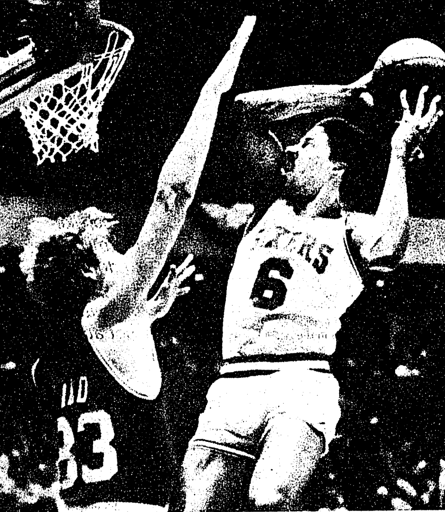
Philadelphia's Julius Erving, shooting over Boston's Larry Bird, scored 28 points to lead the 76ers to a 99-97 victory last night in Philadelphia in the third game of their semifinal playoff series.