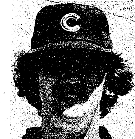
Bruce Sutter New York Yankees took the American League honor in 1977. Sutter also received six second-place votes and four third-place votes for a total of 72 points, with five points awarded for first-place mention, three points for second and one for third. "In the National League, where there's no designated hitters, a bullpen

CHICAGO (AP) — Reliever Bruce Sutter, whose spit-fingered fastball saved 37 games last season for his Chicago Cubs teammates and tied a National League record in the process, yesterday was named winner of the NL Cy Young award for 1979. "I was shocked. I really thought Joe Niekro would get it," he told reporters in Chicago. "When you win an award like this it's not really one man, but the entire team." "Individual honors are fine," he added, "but I would trade it in for a World Series ring." Sutter, who came within one save of the major league record set by John Hiller of the Detroit Tigers in 1973, narrowly defeated 21-game winner Joe Niekro of the Houston Astros in voting by the Baseball Writers Association of America. The 26-year-old right-hander earned 10 of the 24 first-place ballots to become the second NL reliever and the third in baseball history to win the prize. Mike Marshall won it for the Los Angeles Dodgers in 1974 and Sparky Lyle of the