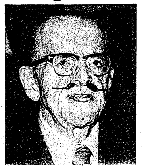
Rep. Daniel Flood

WASHINGTON (AP) — U.S. Rep. Daniel Flood, D-Pa., facing a federal retrial on bribery and conspiracy charges, announced yesterday he will resign from the House of Representatives for health reasons, effective next Jan. 31.