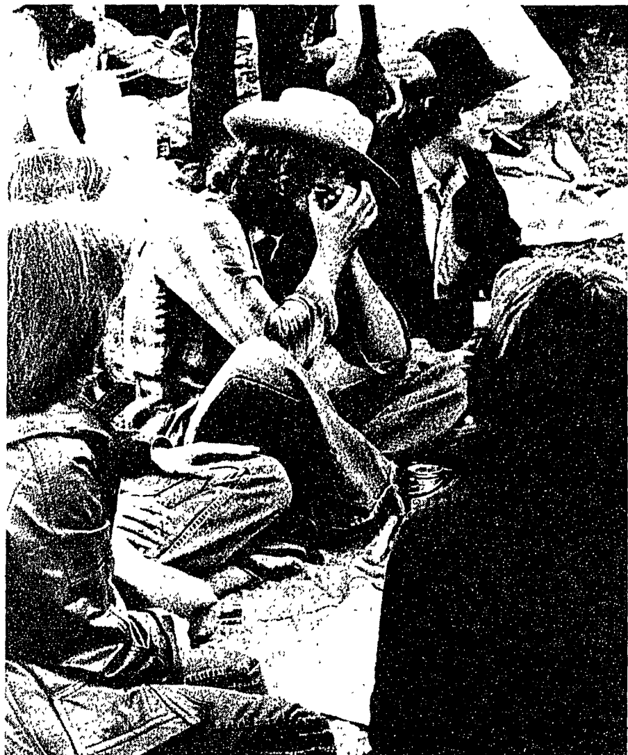
This harmonica player proves the scheduled groups weren't the only musicians on the HUB lawn for Movin' On.