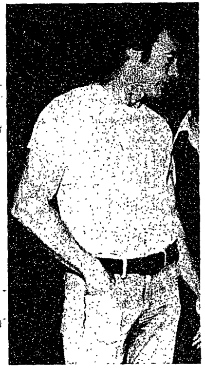
Clint Eastwood stars in "The Outlaw Josey Wales" this weekend on campus.