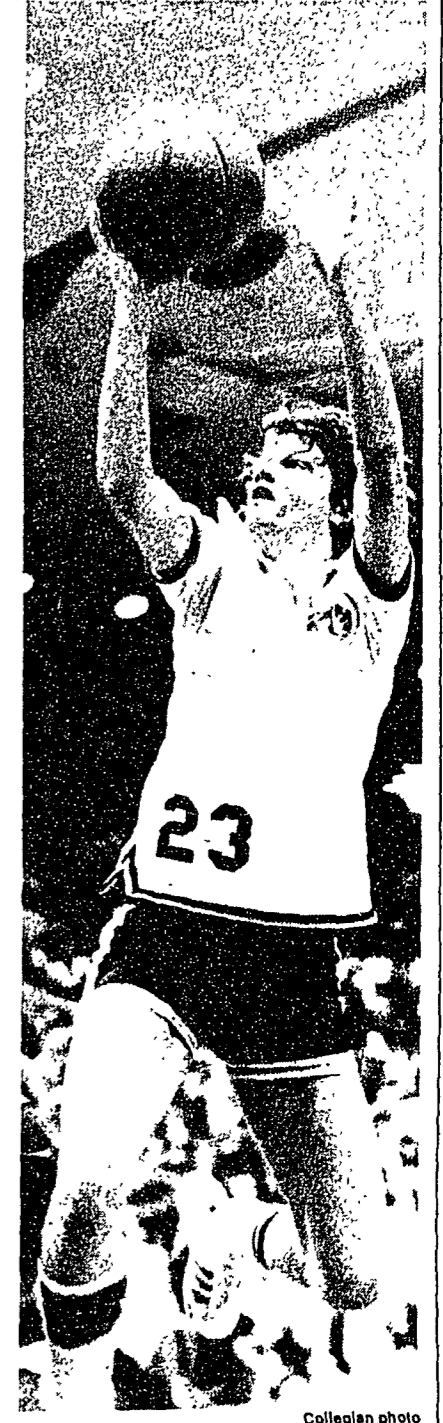
The Lady Lions meet Rutgers at Maryland in tournament action tonight.