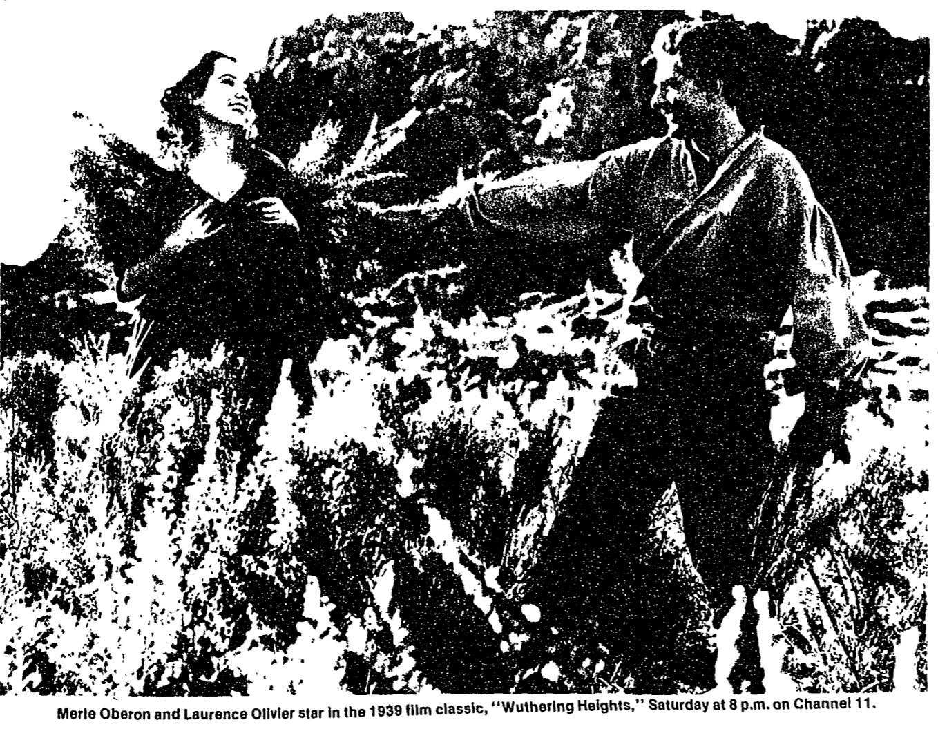
Merle Oberon and Laurence Olivier star in the 1939 film classic, "Wuthering Heights," Saturday at 8 p.m. on Channel 11.

"The Innocents," (1961), an English version of Henry James' "The Turn of the Screw" stars Deborah Kerr and Michael Redgrave. At 6 p.m., Channel 5. Andres Segovia at the White House presents the 86-year-old master classical guitarist in recital. At 8 p.m., Channel 3. Master Theatre opens tonight with "Lillie," a 13-part series about the English actress Lillie Langtry, played by Francesca Annis. At 9 p.m., Channel 3. The Mary Tyler Moore Hour is back and revised as a talk show within a show, similar to the format of the New Dick Van Dyke Show which failed not too long ago. Let's hope Moore fares better than her still funny ex-TV-husband, Van Dyke, who plans to be one of her guests, some week. Beatrice Arthur ("Maude") co-stars tonight. At 10 p.m., Channel 10. Upstairs Downstairs , the Emmy-winning Masterpiece Theatre British series written by John Hawkesworth returns at 8 p.m., Channel 11, and 11:30 p.m., Channel 6.