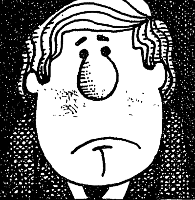
Sera Tec Biologicals 120 S. Allen (Behind Rite-Aid)