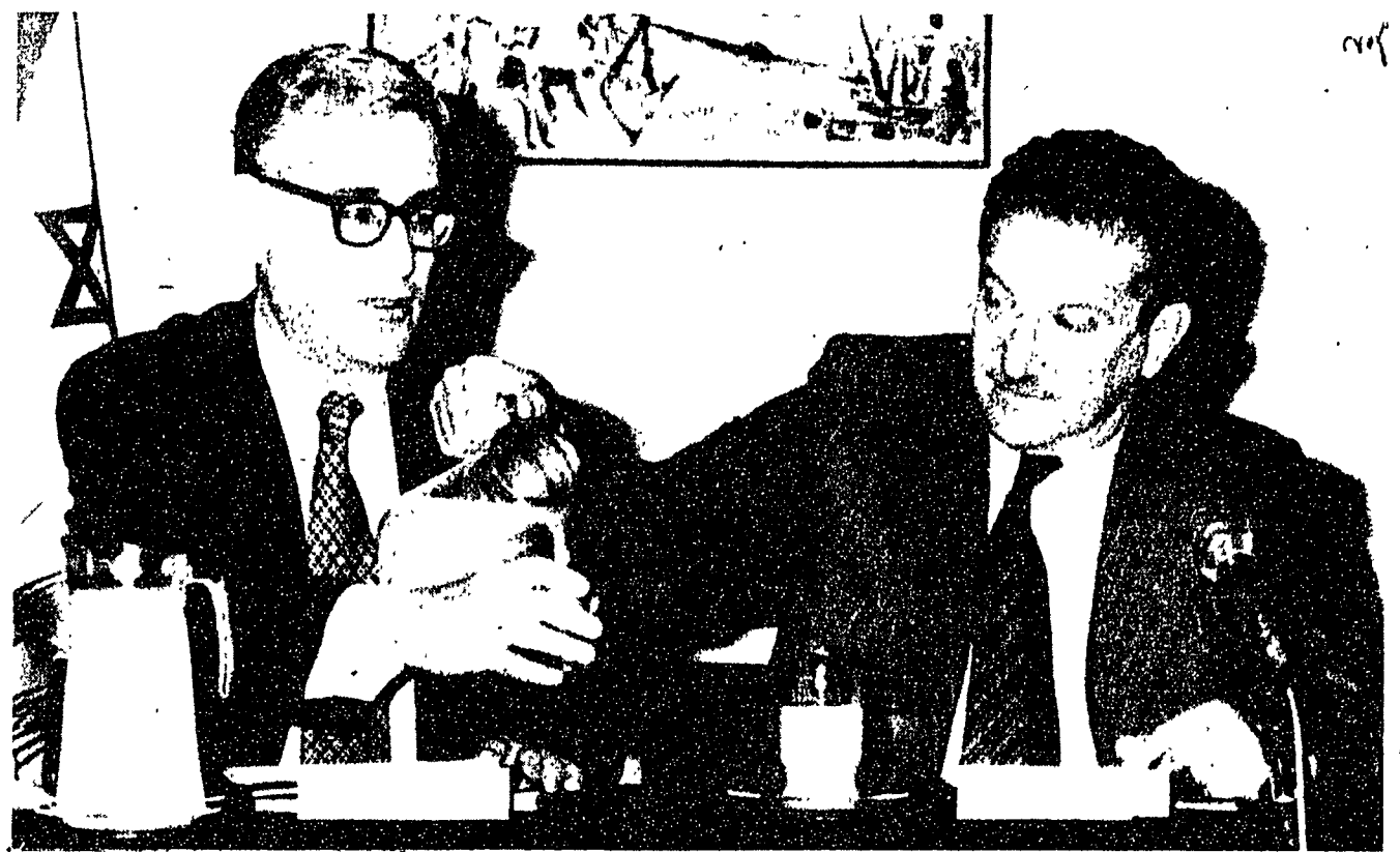
U.S. Defense Secretary Harold Brown yesterday met with his Israeli counterpart Ezer Weizman in Tel Aviv to discuss Israel's plans for a peacetime armed force