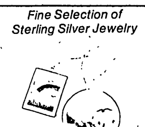
across from Old Main