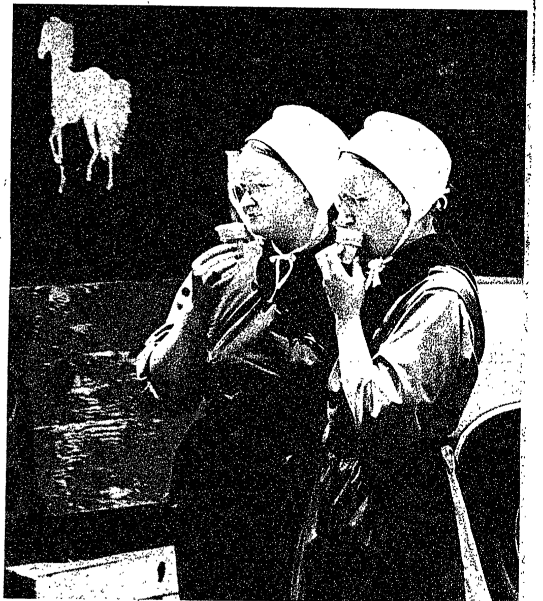
Two sisters enjoy ice cream at the outdoor auction