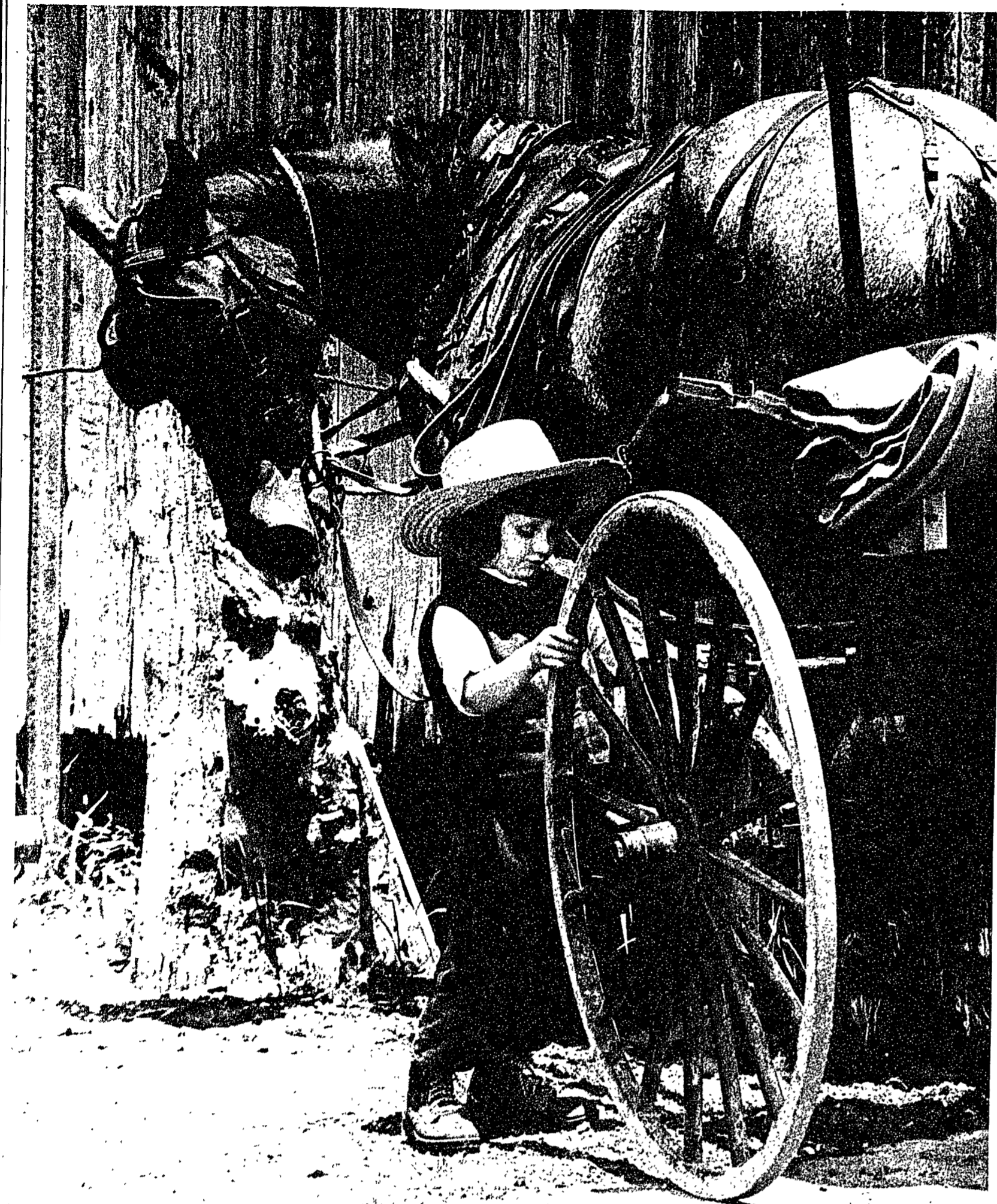
Barely taller than the wheel, an Amish boy prepares to climb into his family's wagon