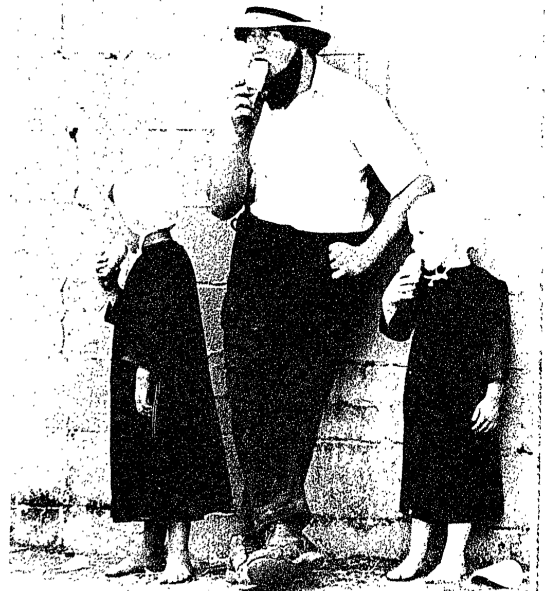
A family trio finds relief from sweltering heat