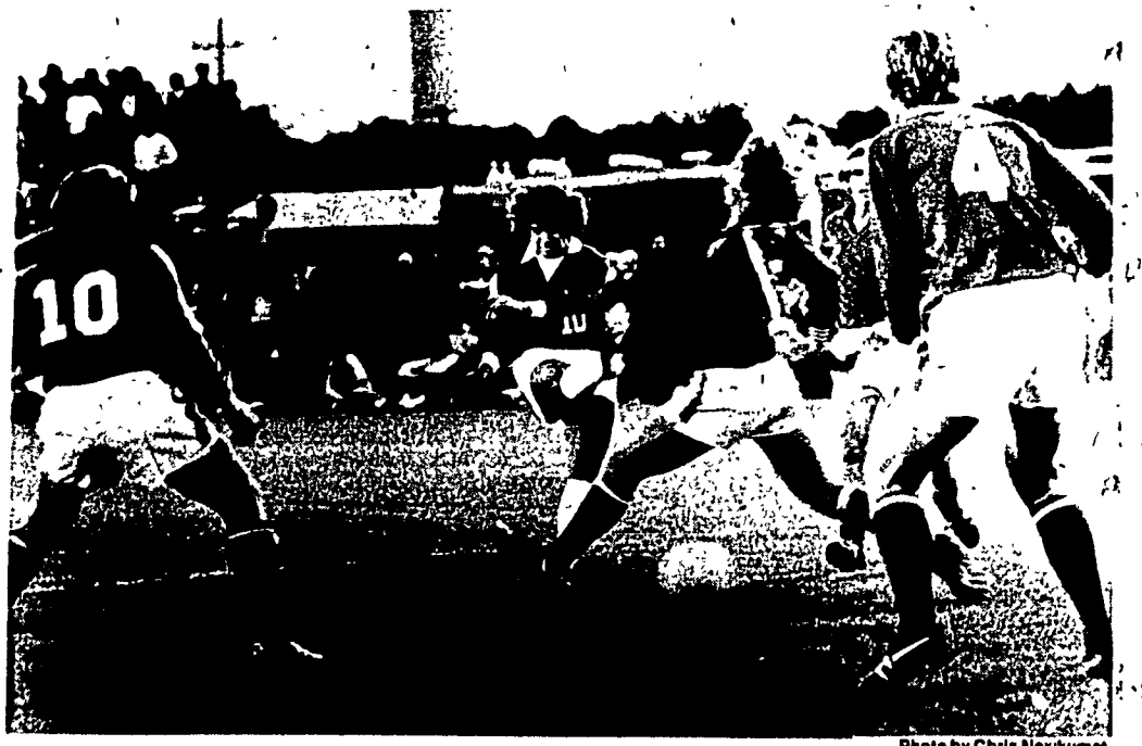
First of three

The Lion booters will take on an Irish University team in an exhibition game tonight at 7:30 at Jeffrey Field: