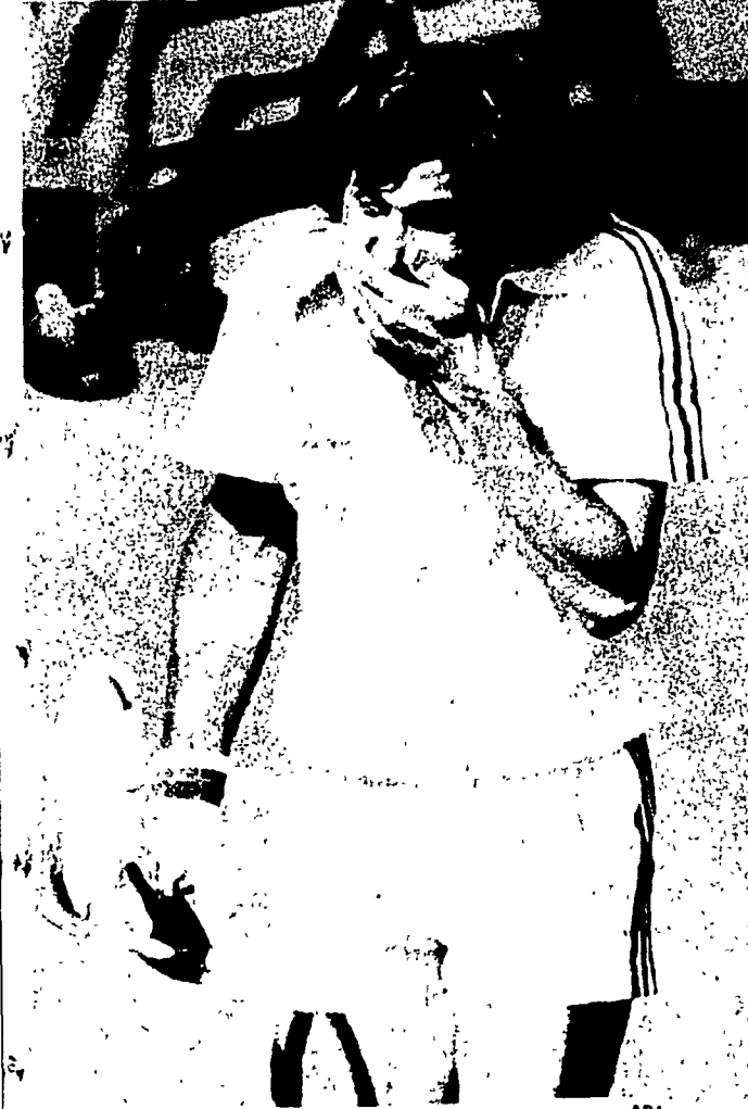
Grins and Wins Ilie Nastase gained way to semis at Forest Hills.