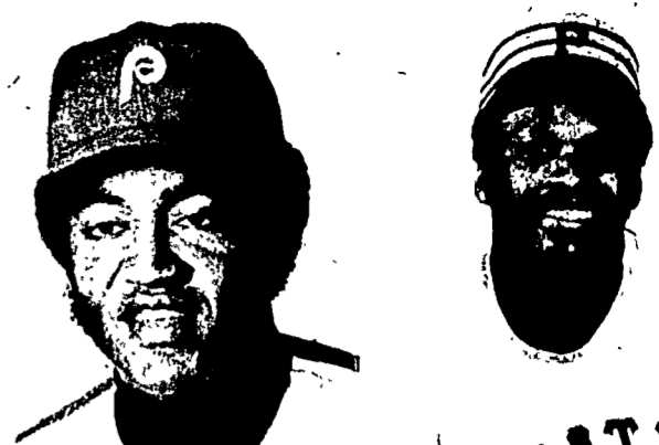
Stars in last night's baseball action, Ollie Brown (left) of the Phillies hit a two-run pinch-homer in the Phils 6-3 win. Al Oliver (right) also clouted a two-run job in the 6-1 Pirate win.

PHILADELPHIA (AP) — Bobby Tolan's grand slam home run and Ollie Brown's two-run pinch-homer in the sixth inning last night powered the Philadelphia Phillies to their sixth straight victory, a 6-3 triumph over the Houston Astros. Tolan's homer, his third of the year and the second grand slam of his career, came off Joe Niekro, 1-5. A walk, a hit batsman and Jay Johnstone's single loaded the bases before Tolan wiped out Houston's 3-0 lead, lofting an 0-1 pitch just over the right field wall at the 350-foot mark. Tommy Hutton then reached second base on an error before Brown, batting for winning reliever Ron Reed, 2-0, belted his long homer to left, chasing Niekro. Brown's homer was his first of the season. Cliff Johnson smacked a solo homer in the fourth and drove in a run with a base hit in the first as the Astros built their 3-0 lead off Phillies' starter Steve Carlton.