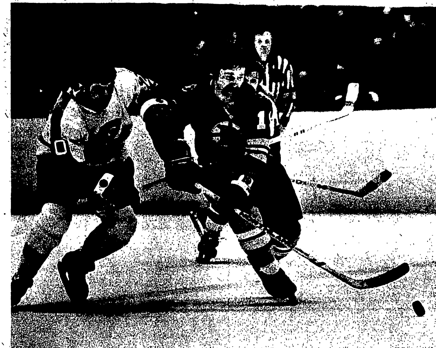
The Flyers' Jimmy Watson and the Bruins' Gregg Sheppard chase the puck in last night's NHL semifinal playoff game. Philadelphia just got by Boston, 2-1

The Lion laXers plan to change their basic offensive sets against Lehigh, but still need work on ground balls