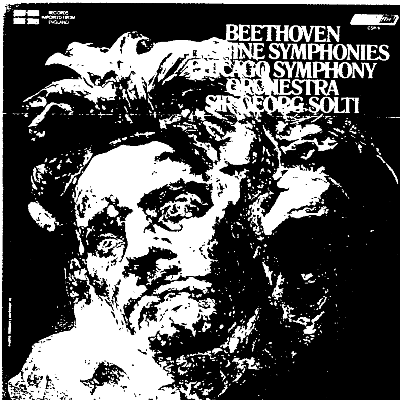
CSP 9 (Nine Records boxed with 16-page Illustrated Booklet)