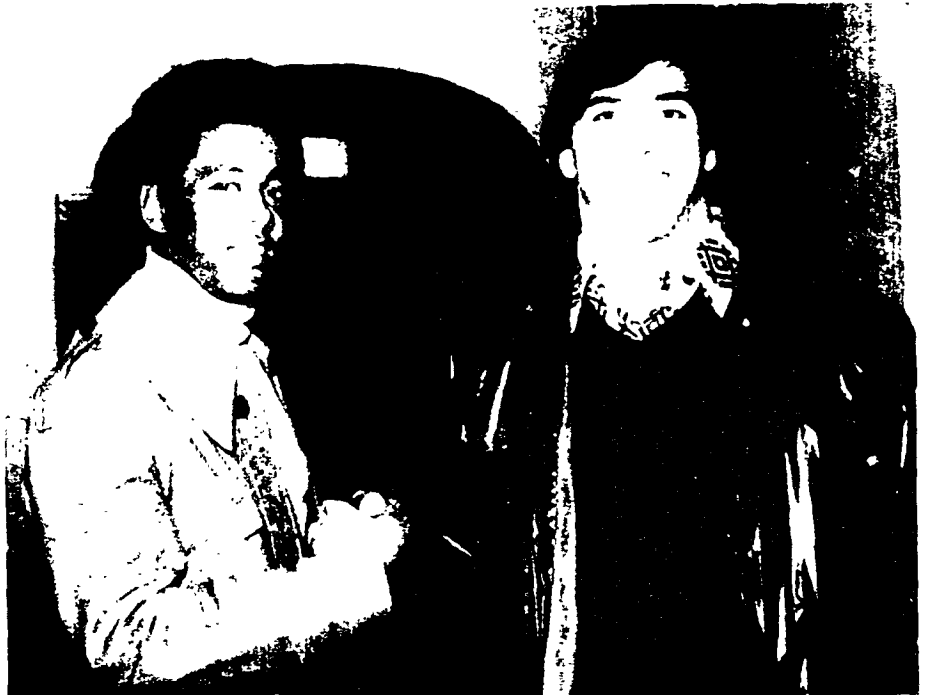
Tony Dorsett (left) congratulates Heisman Trophy winner John Cappelletti. Dorsett leads Pitt against Arizona State in the Fiesta Bowl Friday night.