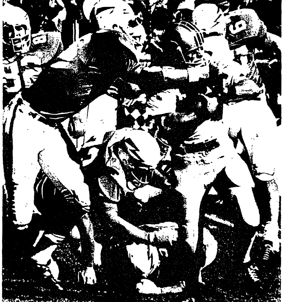
The Air Force defense compensates for size with speed

WHEN DOES THE GAME END AND THE TERROR BEGIN?