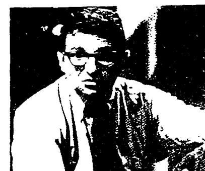
A good feeling...

"I have a good feeling about this squad. They appear to like each other. That's a big