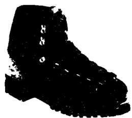
Whitney by Vasque