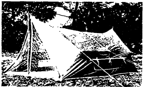
Eureka Lightweight Two Man Tents (4lbs. 3 oz.)