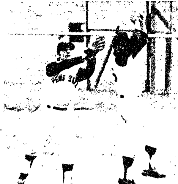
'I got it'