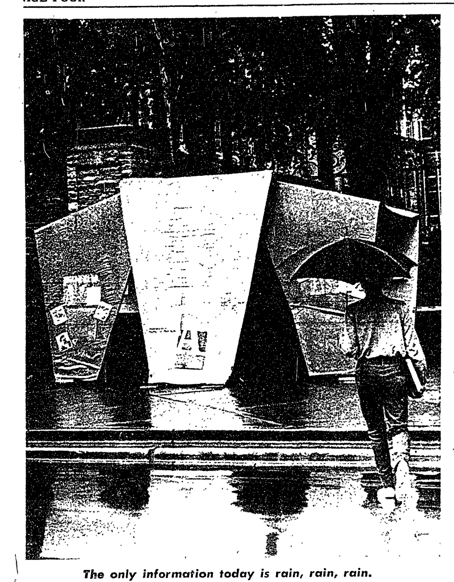
Central Pennsylvania Festival