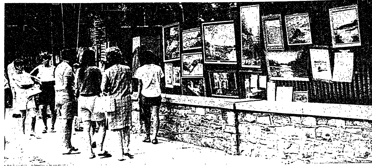
Browsers appraise the many paintings displayed along the sidewalks