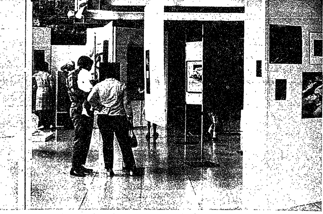
All the art isn't outside, juried works are on display in the glass cage of Hammond building.