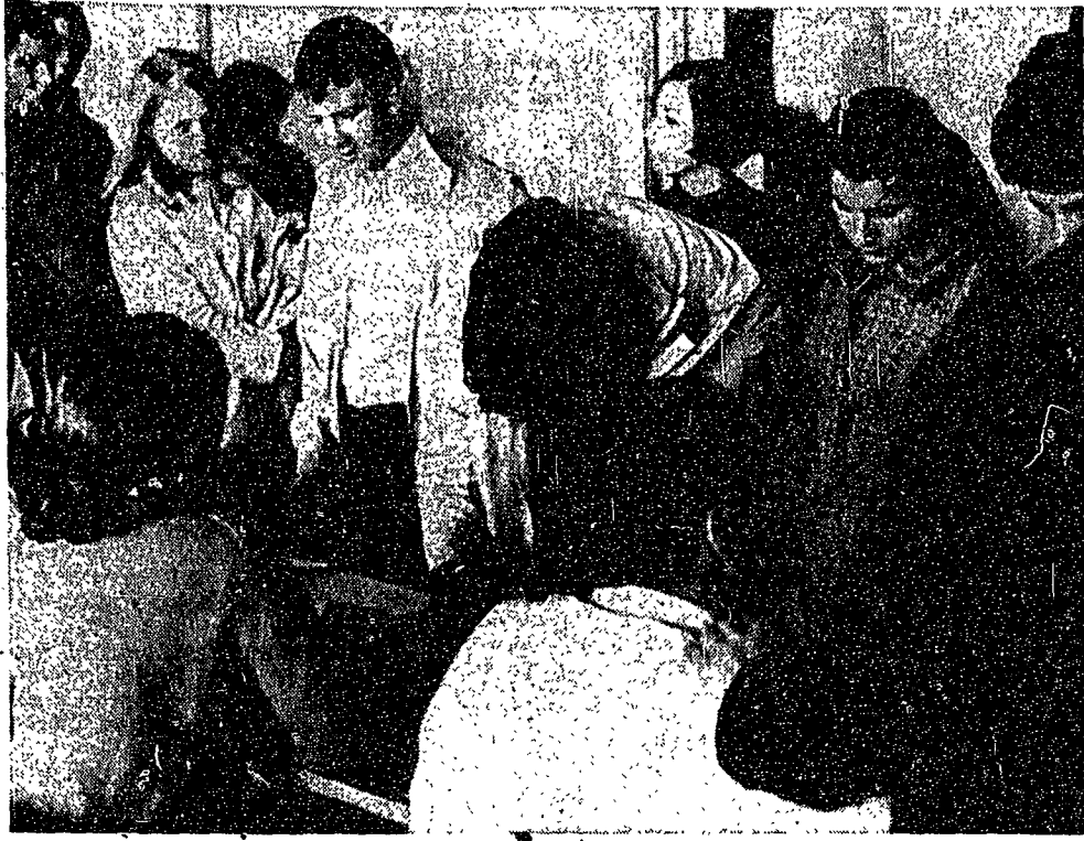
STUDENTS REGISTER in HUB yesterday for the upcoming USG elections. Conventions will be held this week.