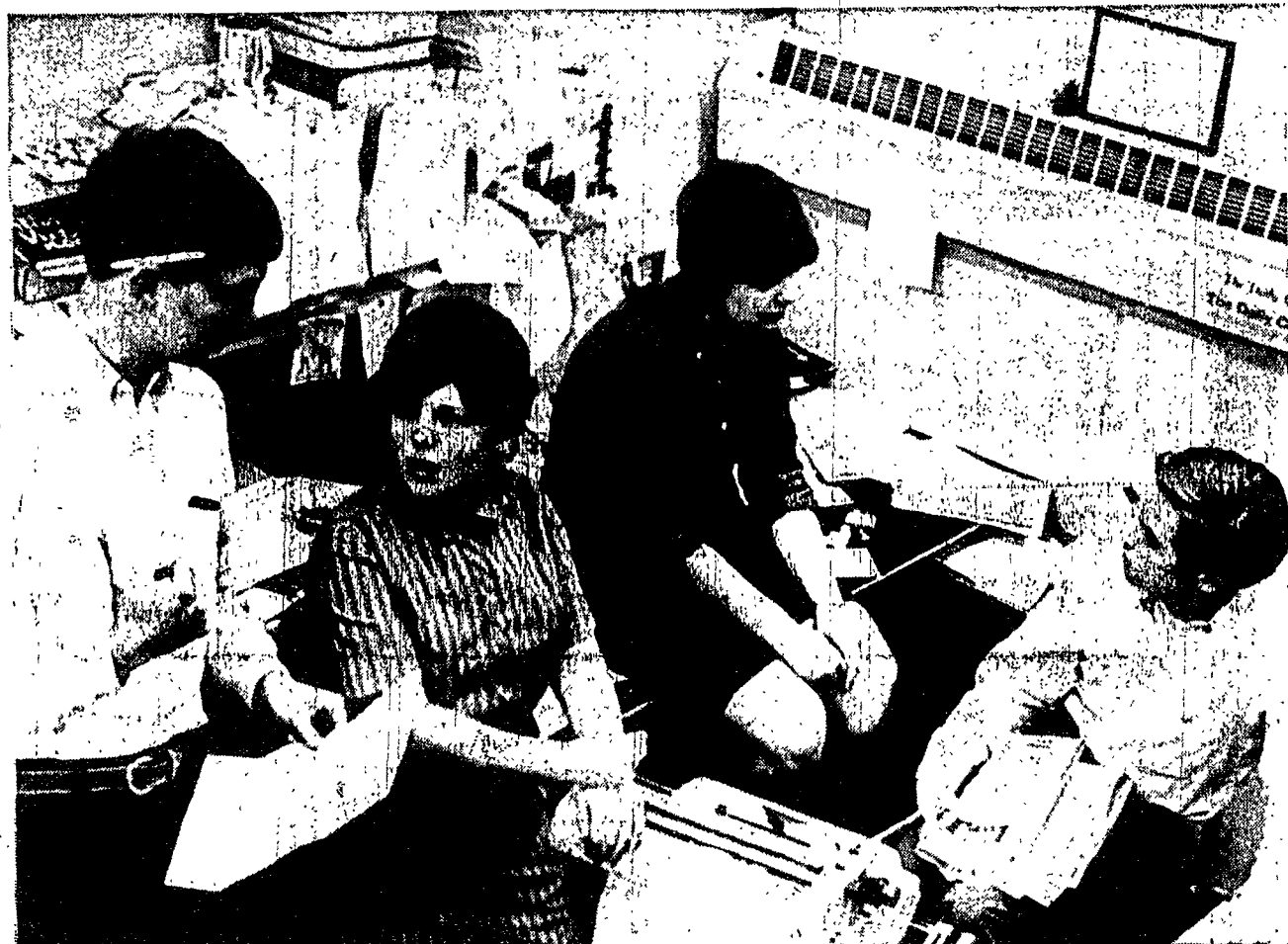
The "BOE"—Board of Editors— at a weekly policy meeting