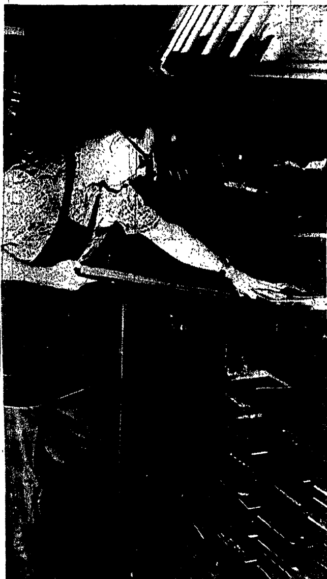
Mervin Orndorf assembles type for a story at The Centre Daily Times shop