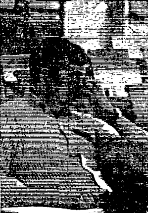
When You Must Keep Alert

were also presented at this meeting. A new bill concerning open bidding this term was passed at Tuesday's meeting. Any sorority expecting a drop in membership in the fall to less than forty-five members may extend open bids. Girls who have participated in a rush on this campus are eligible for bids; as are women who have not participated in a rush here, if they pay a $1.00 fee at the Dean of Women's Office and are not first term students. Beginning next Tuesday night, Panhel will sponsor a series of lectures on self-defense. The guest speaker will be in the Hertzell Union Ballroom May 2, 3, 8, 9, 15 and 16. Two lectures will be given each evening—one from 7:00 to 8:30 and another from 9:00 to 10:30. Sunday, May 7th is the day for a pledge trainer's workshop. Starting time is 7:30 p.m. The sorority women were also reminded that Spring Week is three weeks away. Bids for working at Homecoming in the fall will be extended two weeks after Spring Week.