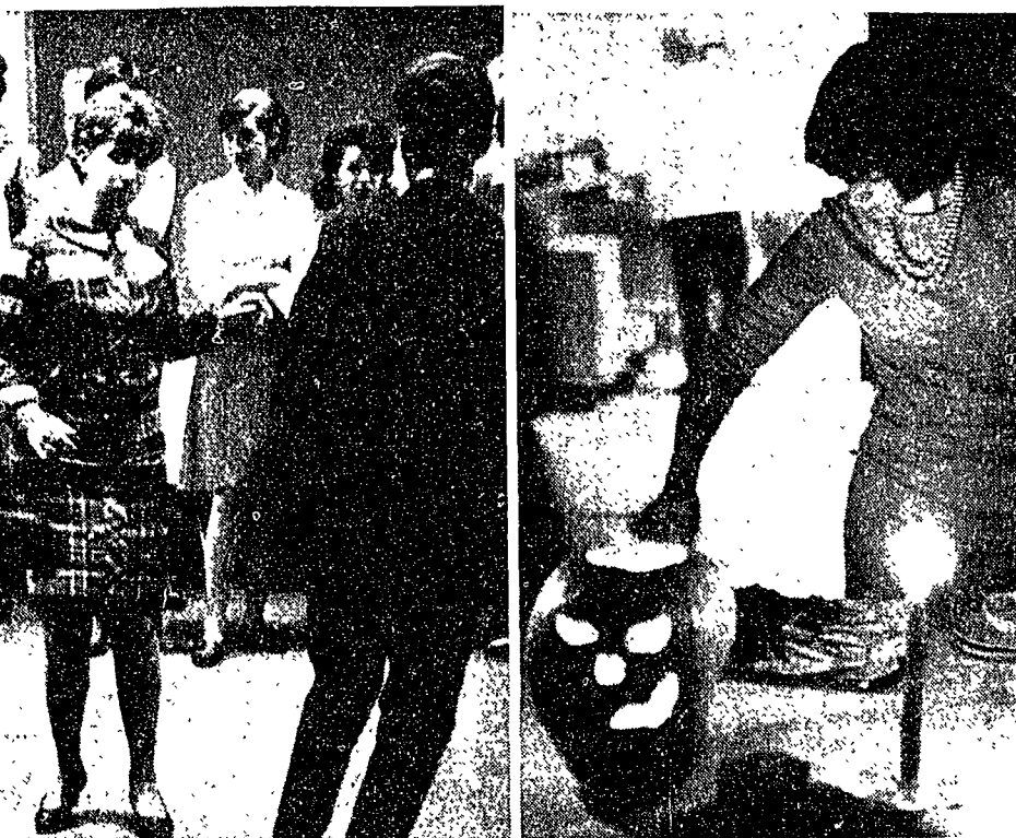
HALLOWEEN celebrating began last night with jammies in many of the residence hall lounges and candlelight dinners in the dining halls. The jammy here is in Ewing, in South Halls, and the Pumpkin display at dinner in Pollock.

The Republican candidate's Lewistown visit was the first he had made in this area since he spoke at the University in 1962. He is the only major candidate to appear near State College in this campaign.