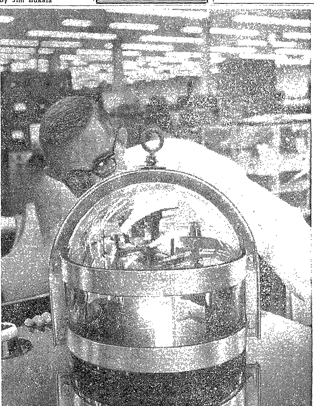
"Will I find exciting, rewarding challenges at W. E.?"

Name ..... Address ..... Add 50c if air mail reply desired