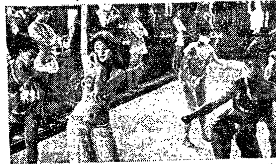
THE PLEASURES OF SIN! Beauties...gathered from the four corners of the world...for the world's most dissolute dynasty!