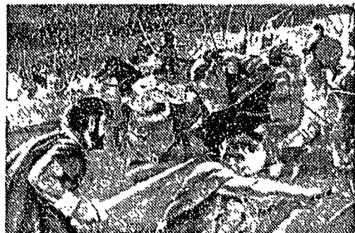
STORY OF THE TWIN CITIES OF SIN!