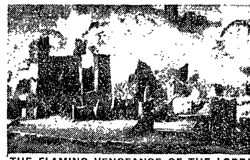
THE FLAMING VENGEANCE OF THE LORD!