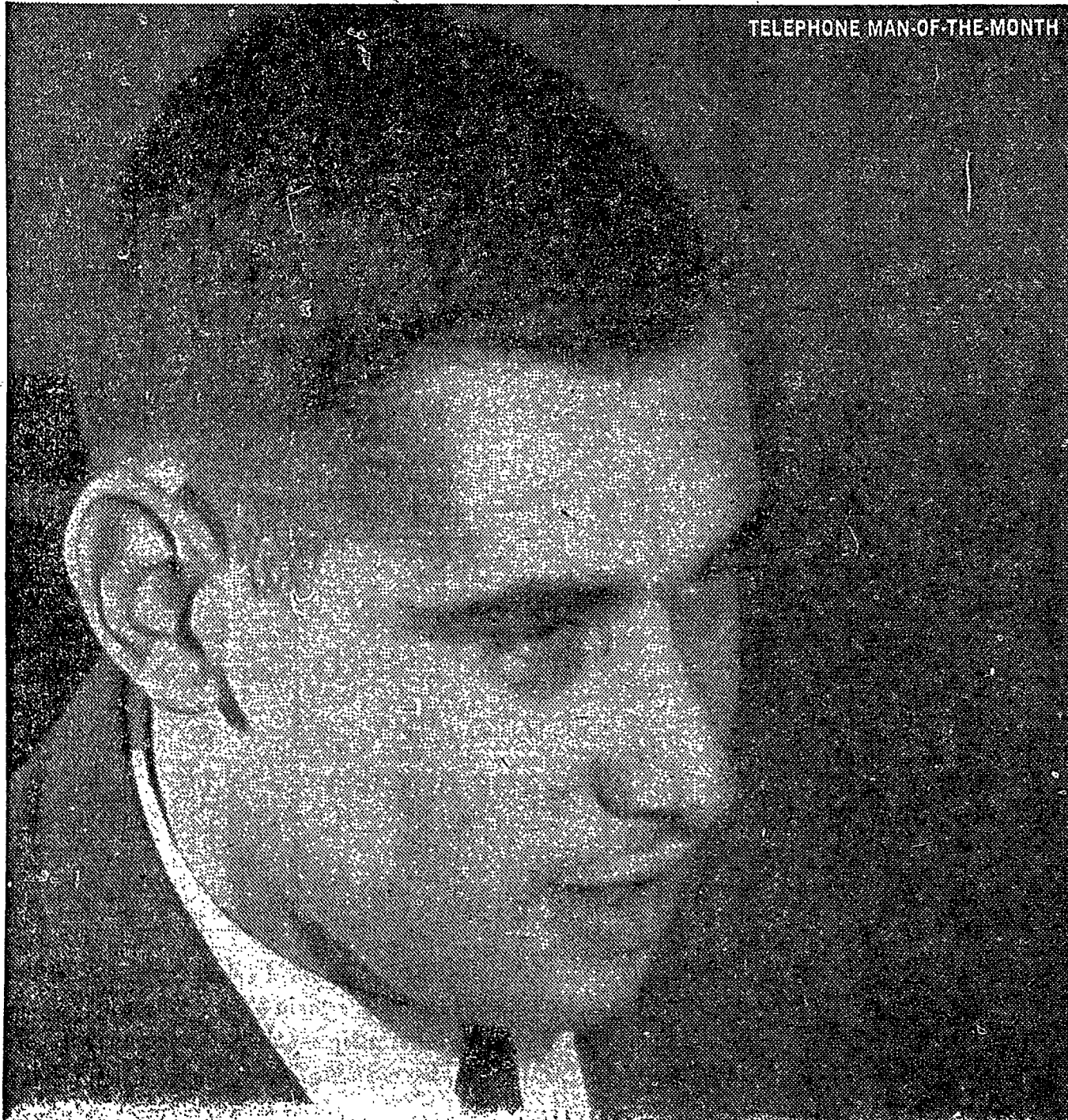
TELEPHONE MAN OF THE MONTH