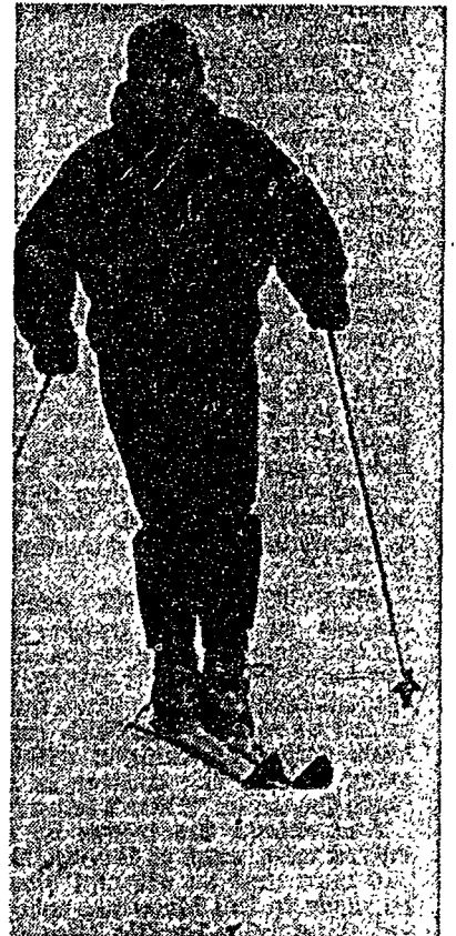
COMING DOWN: A skier maneuvers down the slope at Skimont to make a "landing" on the home stretch at the base of the mountain. The verticle drop on the sloping mountain totals 385 feet. There are experts trails of 1,700 feet and a beginners trail of 3,000 feet.