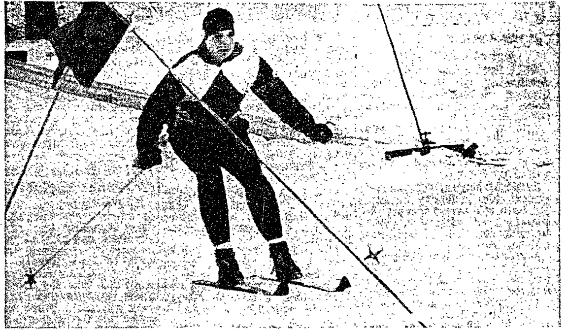
OBSTACLE COURSE: A skier hopefully rounds another turn in a trail dotted with flags to mark the way. Lessons are provided in both advanced and basic skills by certified ski instructors. Skis, poles and boots may be rented.

Individual student tickets for the entire skiing season are $35.00. Ski equipment may be rented.