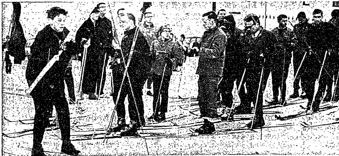
ALL ABOARD— A student sits on T-Bar for the ascent to the top. With feet (or skis) on the ground all the way, he will be pushed up the grade of the slope. One T-Bar can accommodate

two persons per trip. The only facility for a similar downward trip is the skier's ingenuity and skill.