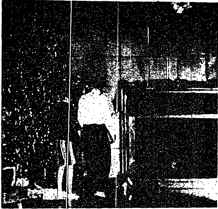
YULETIDE SPIRIT: The holiday season is in full swing in Waring Lounge as the yule log burns in the fireplace to warm the hearts of weary students. The lounge was decorated by residents last Wednesday.