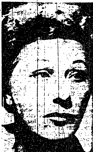
DAME JUDITH ANDERSON

American theatrical producers also insist on using Dame Judith's