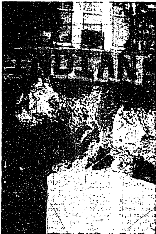
ALPHA EPSILON PI fraternity won the Interfraternity Council Lawn Display contest with a display consisting of an Indian village of teepees overlooked by a gold Nittany Lion. Shown above is the Nittany Lion which overlooked the teepees.

THE DISPLAYS , a traditional part of Homecoming Weekend, are set up by the fraternities in order to show their support for the football team. Thirty-five fraternities participated in this year's competition.